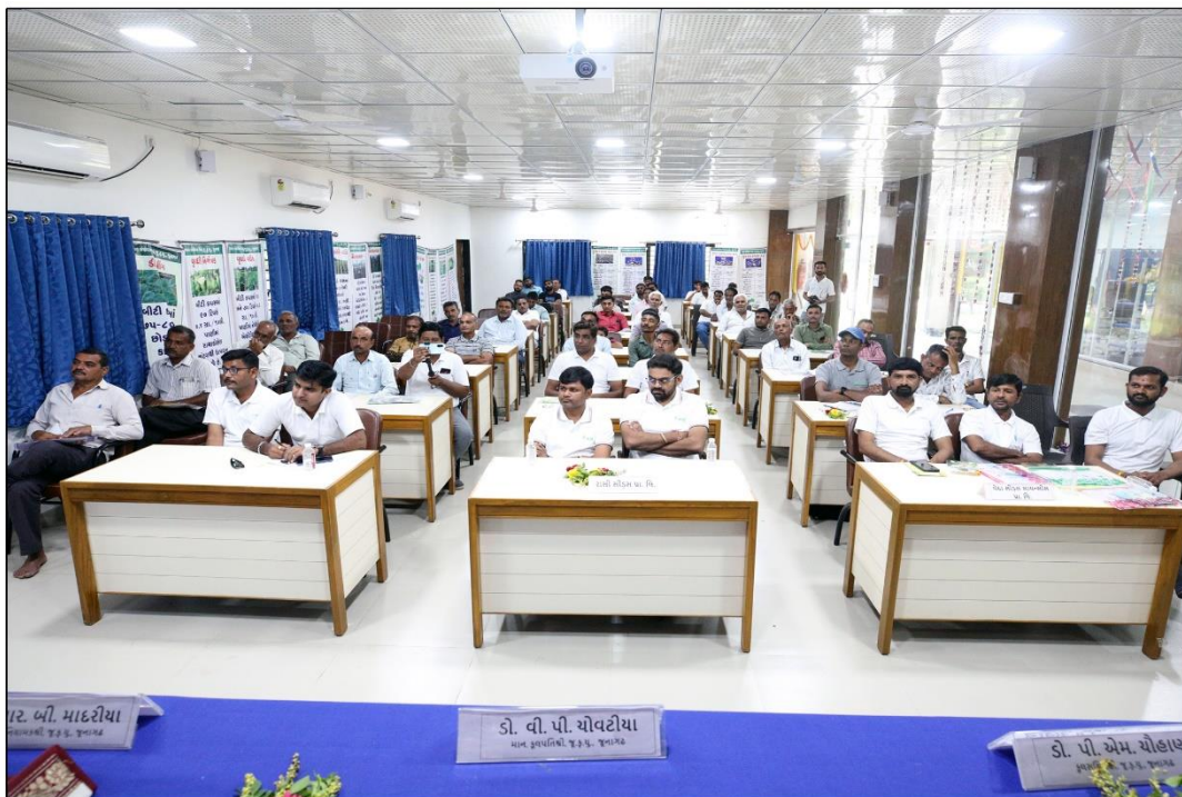
Lectures delivered by different scientists to the progressive farmers